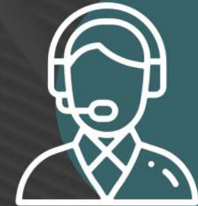
CLIENT INTERACTION SOLUTIONS